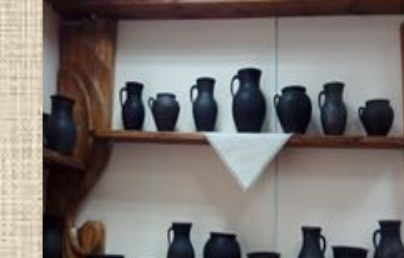
Porozovo fictile ware

Beautiful and practical earthenware crockery were widely used in everyday life.