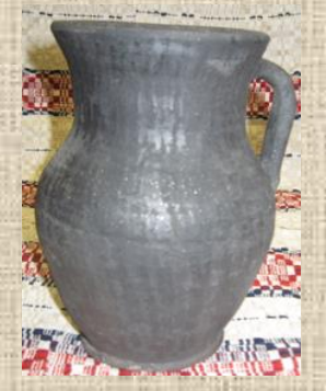
Stoneware milk jug